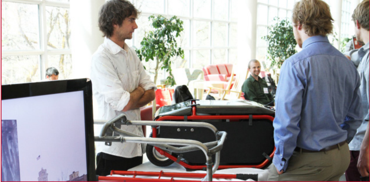
SNOW SPORTS WINCH: Capstone students designed and built a lightweight economical gas-powered winch system that accelerates skiers and snowboarders up to a target velocity.

SELF-RELEASE PARKING BOOT: This project is to improve upon the design of the current Paylock SmartBoot. Paylock's Smart-Boot is designed so that the recipient of the parking boot can pay their fine over the phone and receive an unlock code to take the boot off themselves by punching the code into a keypad on the boot. This eliminates the need for officers to go back to the location and remove the boot themselves. However Paylock's current boot has a very high theft rate (20% in Oakland) and costs $450 to manufacture. Our task is to make the SmartBoot more secure and also cheaper to make.